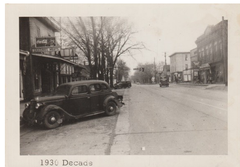
1930s Decade Main Street, Ripley, NY circa 1930s

November 1956 was memorable for the Thanksgiving Day Snow Storm which deposited more than 30 inches of snow on the area and marked the first use of the local school facilities to serve the needs of travelers who found themselves victims of the weather – a scene which would be repeated numerous times in future years.